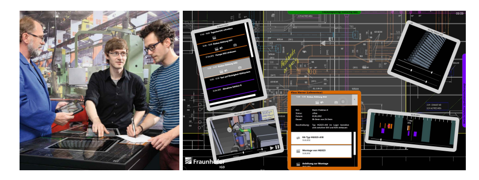
Fig. 2. An assembly team working collaboratively with Plant@Hand on a multi-touch table (left). Spatial and temporal contextualization of work orders in Plant@Hand (right). An underlying CAD drawing is used to provide context to the individual views, which are positioned at the place they refer to, e.g., a particular machine.

Interaction with Plant@Hand bases on multi-touch gestures. Here we allow for data specific interactions that are based on the workflow. A re-planning of resources to solve work-related issues can be done visually by moving work orders with drag gestures between work order view and personalized task views. In a similar way the application supports an interactive visual data analysis for exploring work situations or reported problems. This requires a contextualized interaction with 2D and 3D construction models, as well as with work report documents. Geometric models can be moved using drag gestures, zoomed with pinch and spread gestures, or rotated with a two finger rotation.