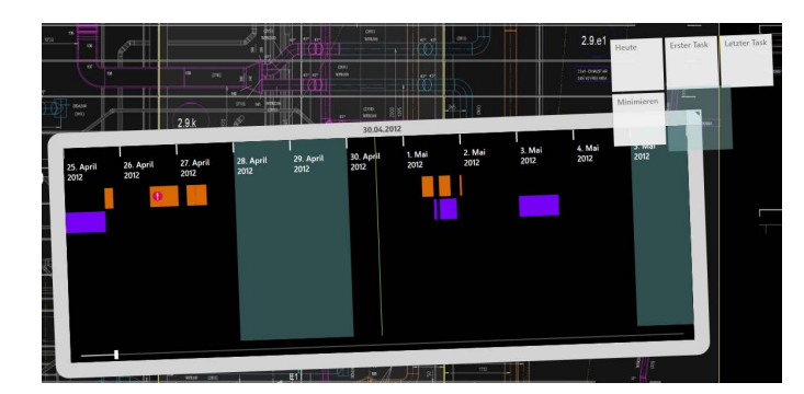
Fig. 3. Contextualized controls of time schedule view.